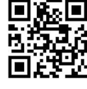
Amazon QR Kids beds

DO YOU WANT TO BLESS OUR CHILDREN? WE NEED 5 BUNKBEDS, 2 TODDLER BEDS, AND 7 CRIB MATTRESSES FROM AMAZON. link- https://a.co/9VdGapQ